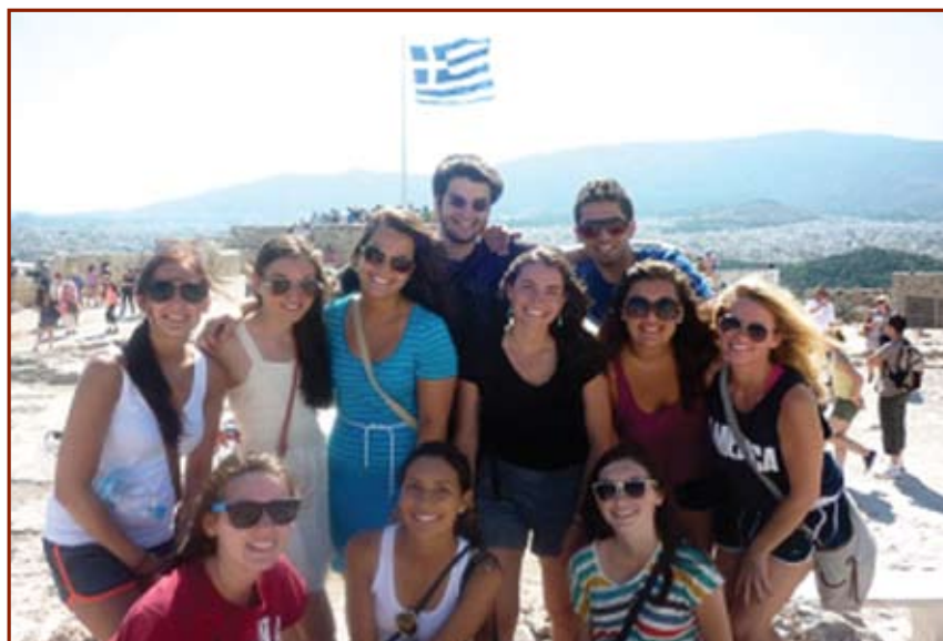
Hellenic Birthright participants at the Acropolis for the first time.