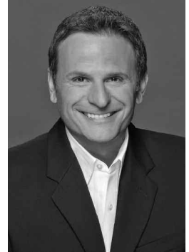
MASTER OF CEREMONIES