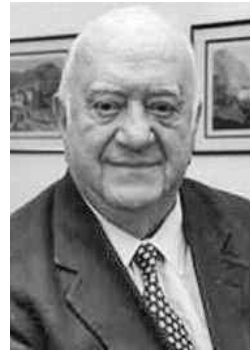
HELLENISM AWARD RECIPIENT