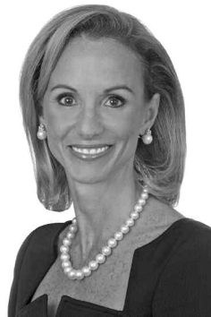
PARADIGM AWARD RECIPIENT

We are proud of our honorees this year who will receive their awards at the PanHellenic Scholarship Foundation Gala Event on Saturday, November 13, 2010.