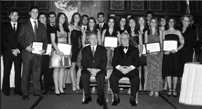
OUR 2008 SCHOLARSHIP AWARD RECIPIENTS

This year, the PanHellenic Scholarship Foundation reconfirms its commitment in its mission and repeats its offer of $250,000 in scholarship awards to 25 deserving Greek American students. And this year, the Foundation's emphasis is on students with financial need, rather than those with ade-