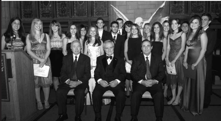
OUR 2007 SCHOLARSHIP AWARD RECIPIENTS

Please continue to help us in this effort. A return envelope is included with this newsletter—taking a moment to write a check will be one of the most rewarding gestures you can make for yourself, your community, and your country.